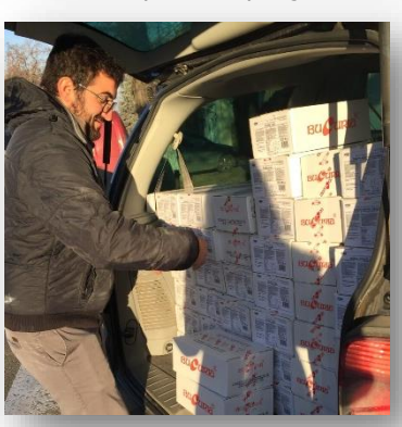
120 boxes of candy!

I can say that God has proven over and over again that His Word is true as we have served Him here in Moldova. He continually provides for our needs and blesses our labor for Him as we step out in faith and do what He has called us to do.