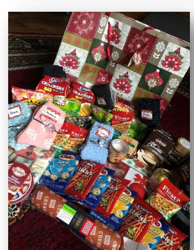
Goodies for the folks at Krasnava.

We are humbled, blessed, and encouraged by each one of you. Thank you for your prayers and support for our family as we serve here in Moldova. So many of you sacrificially gave special offerings to our family