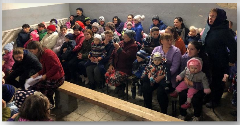
Christmas program in Krasnaya.

If you would like to receive our prayer letters via email, please send an email to our home church at <a href="mailto:contact@BibleBaptistFairbanks.com">contact@BibleBaptistFairbanks.com</a>, with your name, church name and current email address.