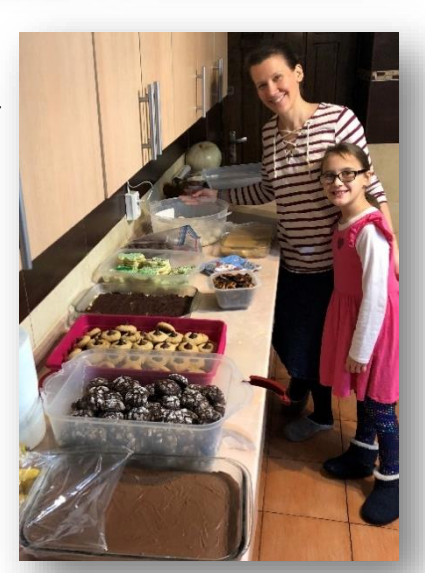
Cookies and fudges and treats!

this Christmas and gave towards the candy project. It is your generosity and support that allows us to reach out to so many people.