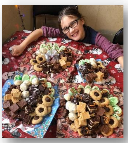
Goodie trays for neighbors.