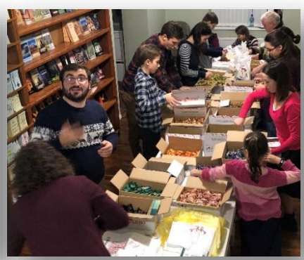
Putting candy bags together after church in December.