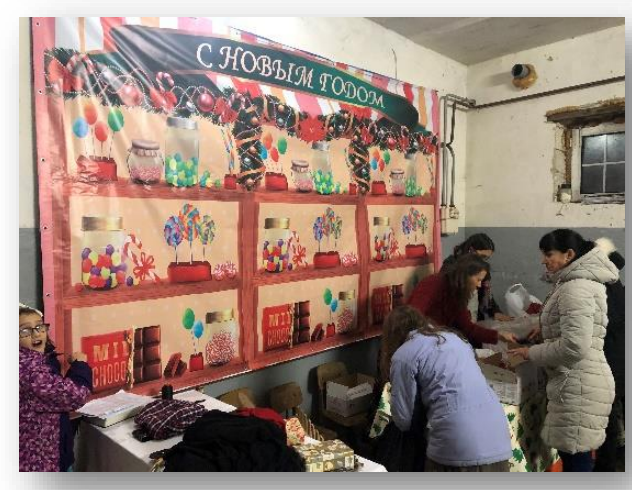
Our "candy store" for the play!